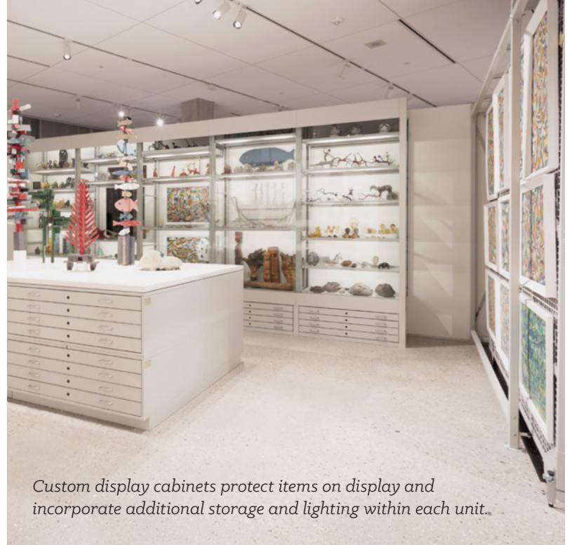
Custom display cabinets protect items on display and incorporate additional storage and lighting within each unit.

The Art Preserve creates an immersive environment while also protecting collections.