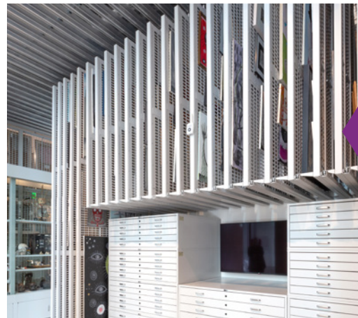
Elevated ceiling-mounted racks pull out over flat-file cabinets to recreate the density of an artist's apartment.