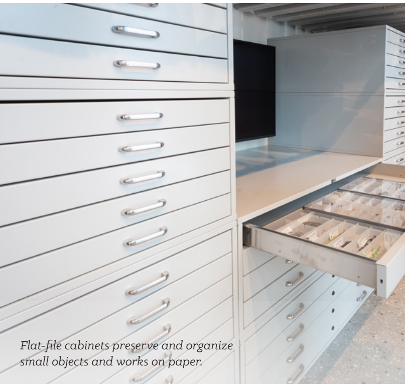
Flat-file cabinets preserve and organize small objects and works on paper.